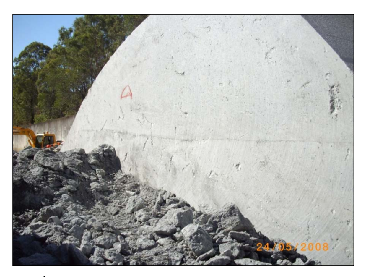
In all 240\text{m}^3 of concrete was removed each cut face was 14.5m long x 5m high approx. Allowing for the ogee shape a total of 48\text{m}^2 was cut on each face.