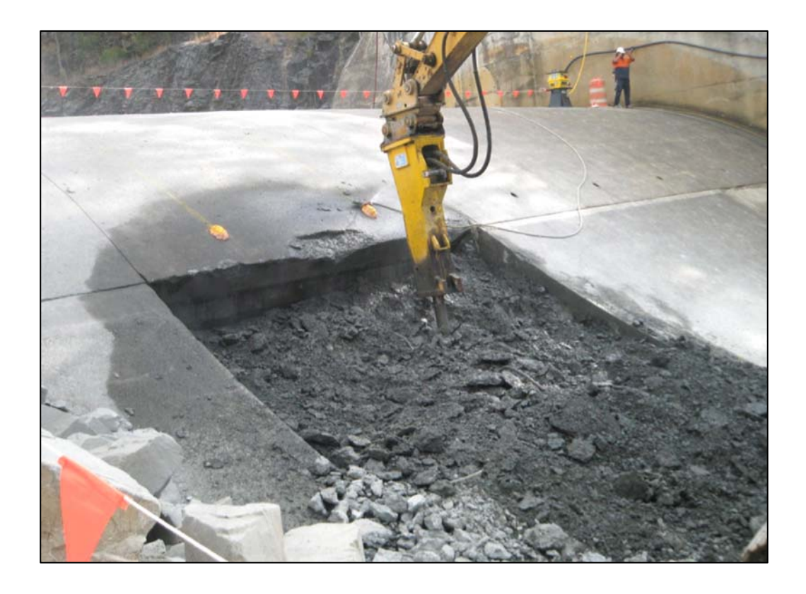
Concrete was then removed with a 20 tonne excavator.