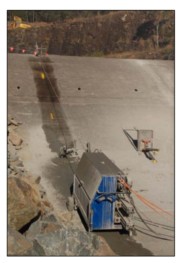
Set-up on left cut