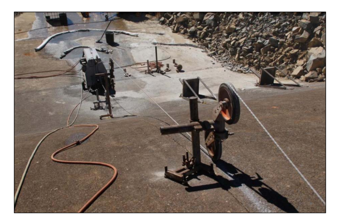
Tension is taken up and cutting begins all excess wire is taken up within the wire saw storage unit as the wire is continuously pulled through the concrete.