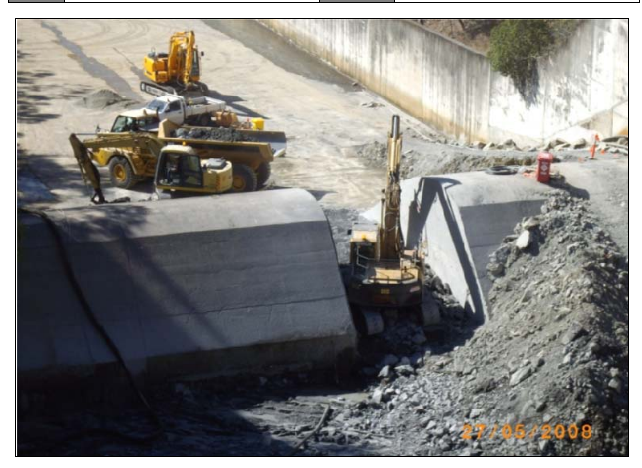
The final opening was large enough to drive a Moxy truck through and would provide access to the upper spillway mass concrete pouring

Hinze Dam Stage 3 Stage 1 Ogee Demolition