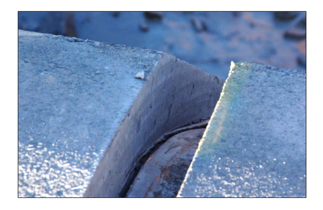
Section through right cut showing control joint and water stop.