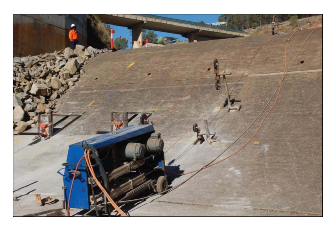
Wire saw was set-up and wire fed through the cored hole and back over top off ogee.