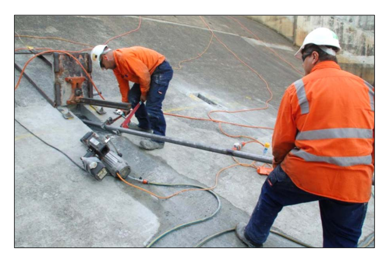
Each of the wire feed holes were drilled using continious barrells. An accuracy of +/- 50mm was maintained in all drilled holes.