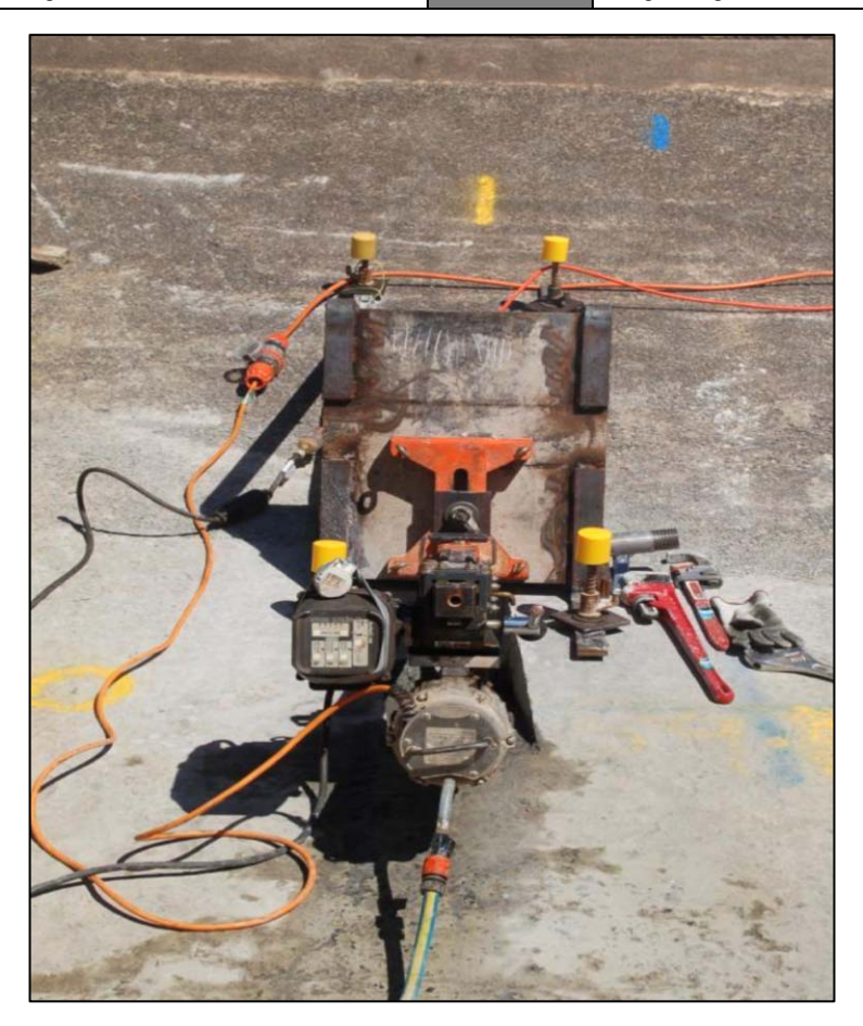
Set-up to drill 50mm wire holes 14.5 metres through lower ogee using 3 phase lower automated drill rig.