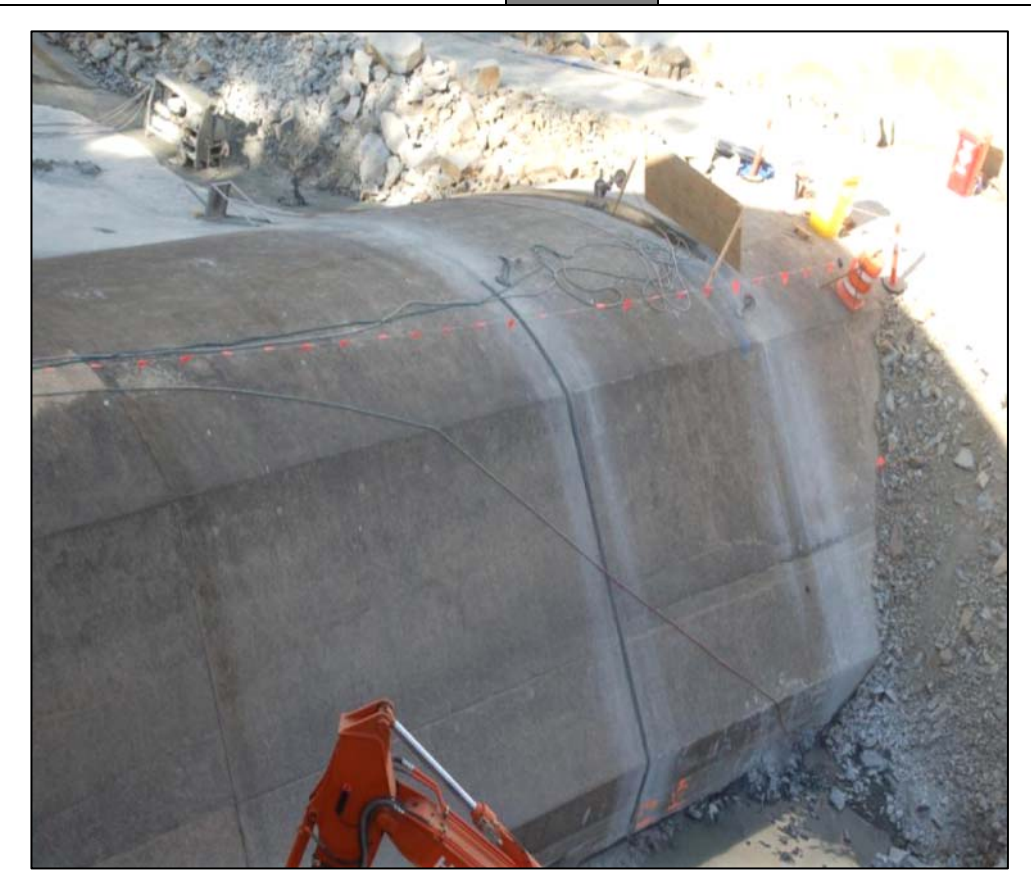
Left and right cuts after completion giving full separation from the surrounding concrete. The concrete contained 20 and 30mm reo bars at 200mm centres.