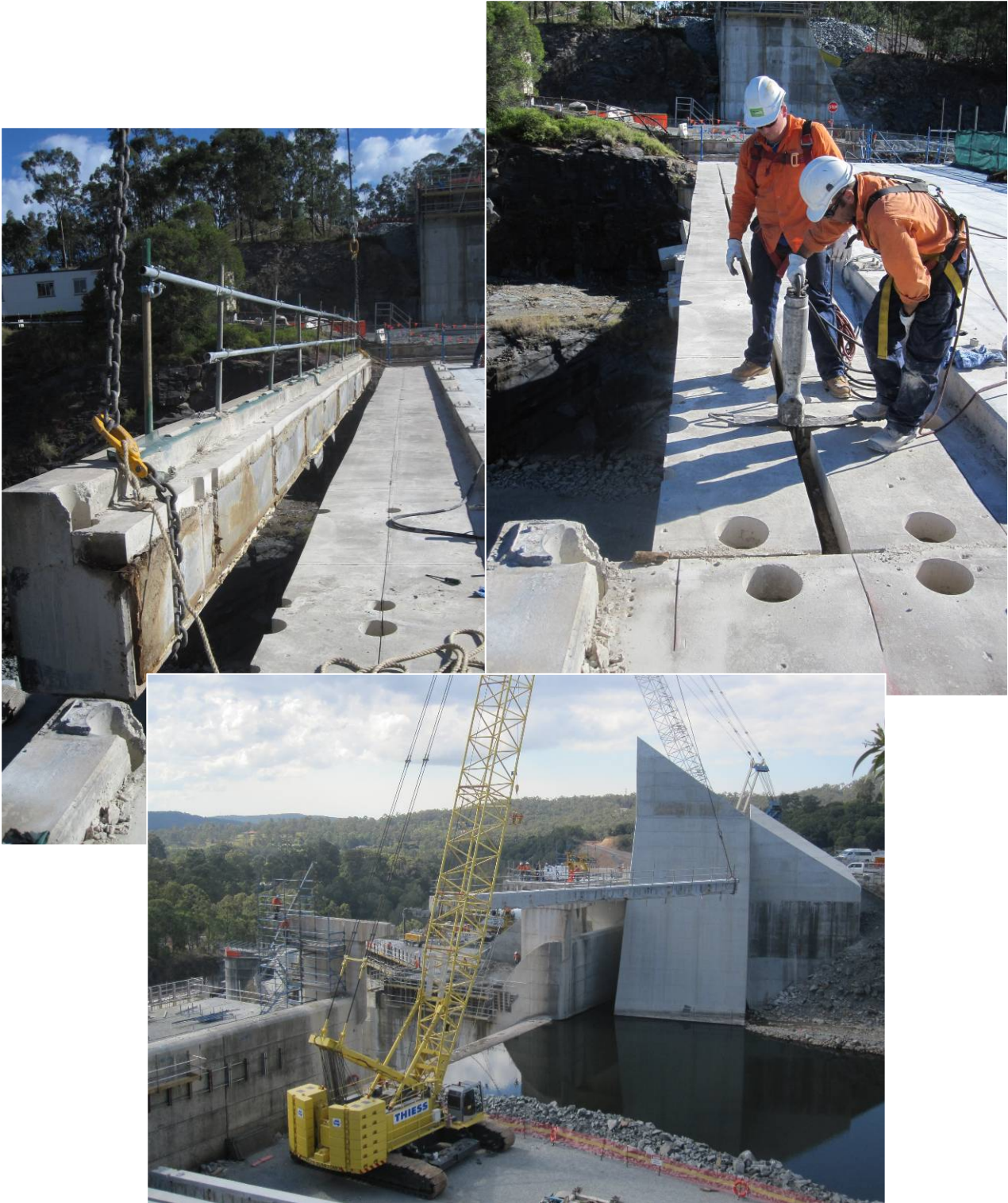
Figure 4 – Splitting and Removing Bridge Beams

DecoTEC provided a fully qualified demolition supervisor to supervise this stage of the process to ensure the task was conducted safely and efficiently.