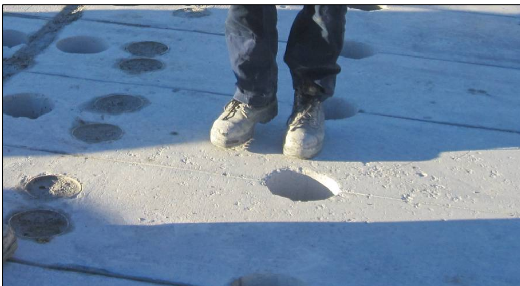
Figure 3 – Sawing and Coring Preparing Bridge for Separation