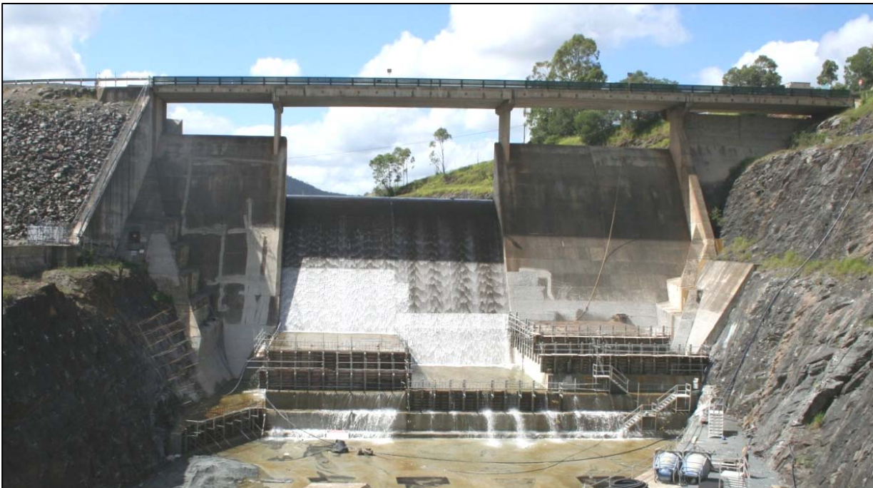
Figure 1 – Stage 2 Spillway Bridge to be Removed