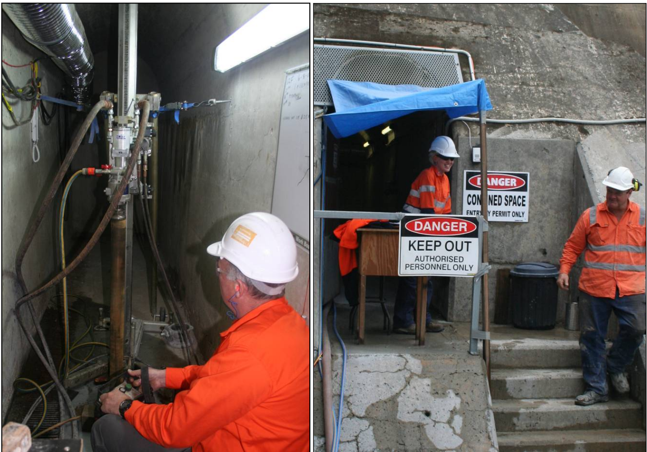
Figure 2 – Left: Entrance to the Spillway Drainage Gallery Right: Hydraulic Drilling Equipment

The required drilling apparatus could not generate exhaust fumes within the enclosed area therefore hydraulic drilling equipment was chosen to complete the work. This gear was exhaust free, quiet and provided powerful and efficient cutting conditions.