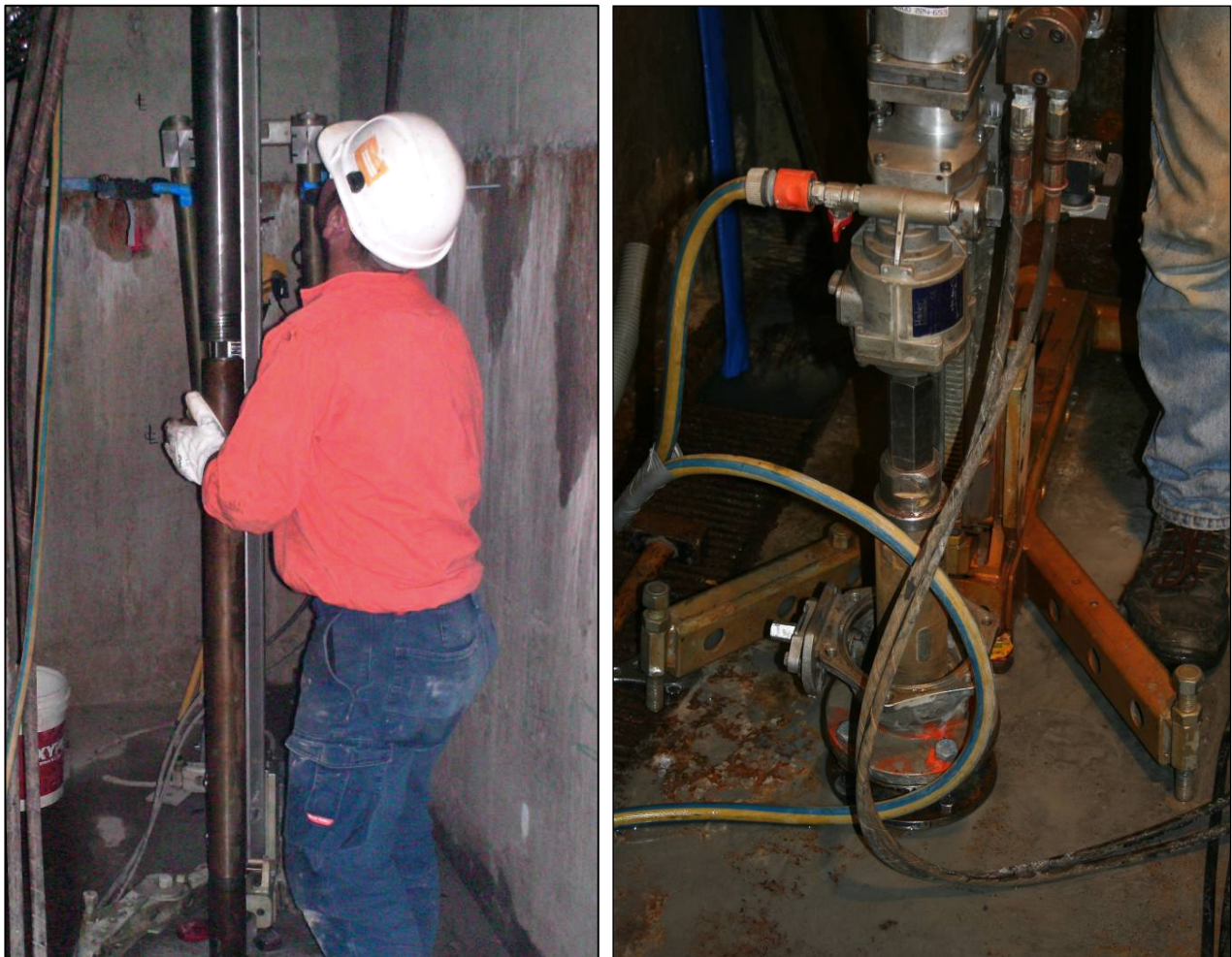
Figure 4 – Drilling Equipment

At the time of coring there was up to 15 meters of head in the dam. This therefore created the potential for water to backflow out of the cored holes generating a safety hazard. Even though the calculated maximum backflow pressure was only minimal DecoTEC wanted to ensure the uttermost safety for their operators therefore a backflow valve was fabricated and installed on each hole.