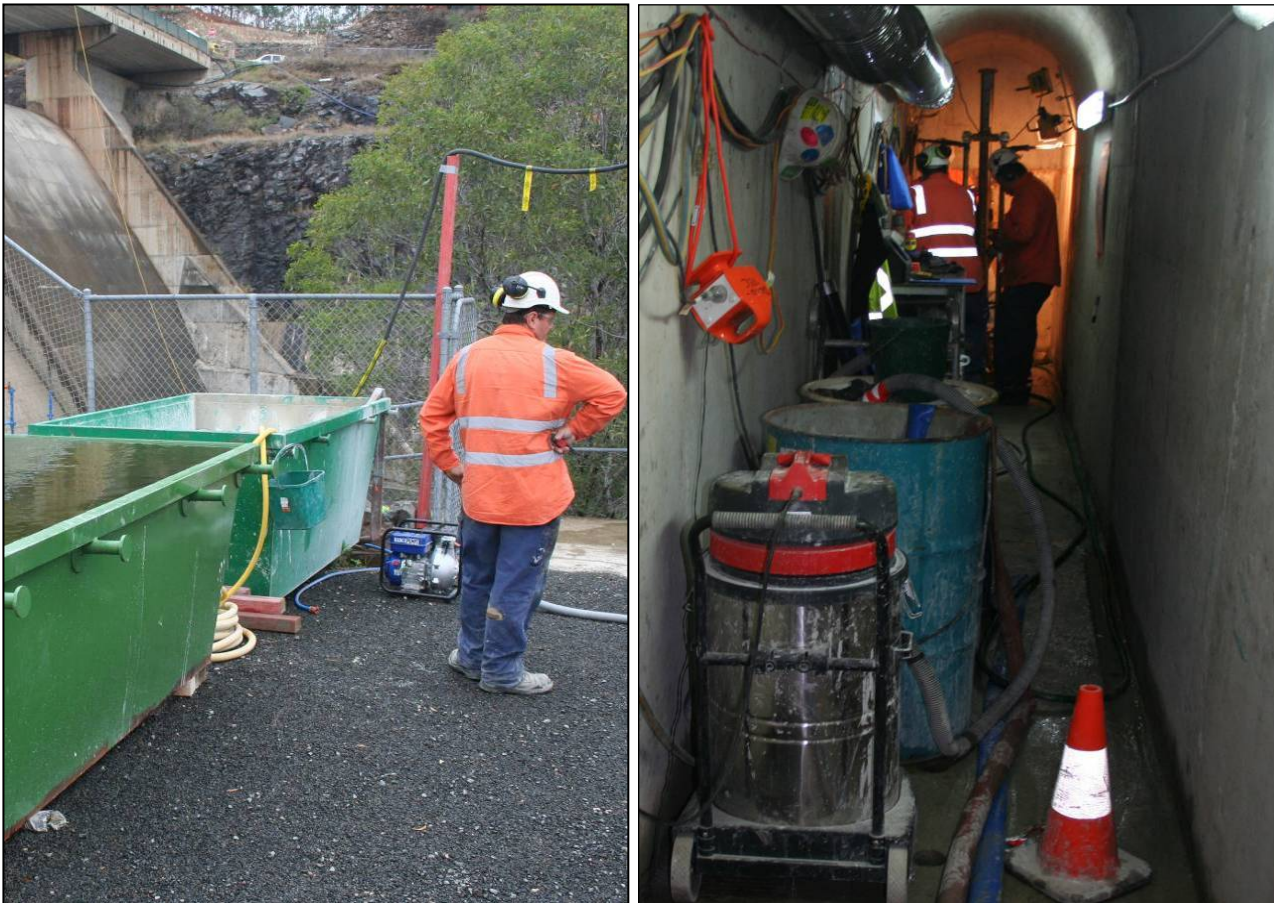
Figure 3 – Left: Gallery Floor Slurry Control System Right: Slurry Collection Tank and Water Supply Tank

Water was provided to core drills via a 3kL tank and a fire pump located outside the gallery.