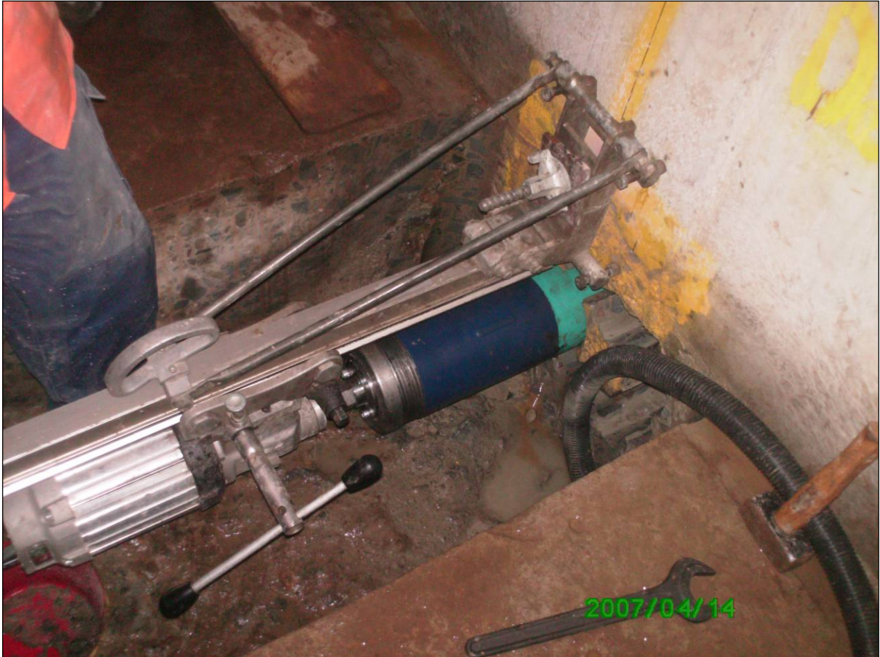
Figure 5 – 160mm Diameter Drain Hole

The horizontal outbound drain hole measured 160mm in diameter and was located below the floor of the gallery. This required a cavity in the gallery floor and a recess in the downstream gallery wall to be cut out to make room for the drilling gear. Along with this tight fit DecoTEC also had to ensure that the appropriate fall was maintained along the entire 18metre length of the hole.